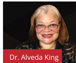
Dr. Alveda King